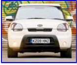
Kia's got it all wrapped up - mind, body and, of course, Soul