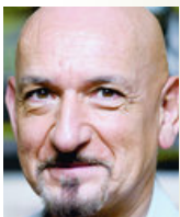
Ben Kingsley: plays an RUC Special Branch agent