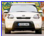
Kia's got it all wrapped up - mind, body and, of course, Soul