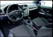
A throwback to the heady days of youth in VW's new Scirocco