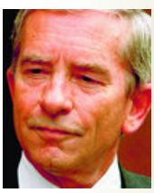
Lord Saville: apologised for the latest delay

FAMILIES OF those killed and injured on Bloody Sunday have issued a public plea to Lord Saville asking why the long-awaited Saville Report will be delayed another year.