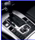
Comfortable, competent and compelling - that's the latest Audi A6