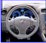
Lexus bows to European tastes with a smart, diesel executive offering