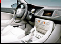
Citroen's new Tourer steals the limelight for estate cars