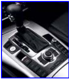
Comfortable, competent and compelling - that's the latest Audi A6