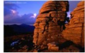
Summit Tor on Slieve Binnian, Mourne...