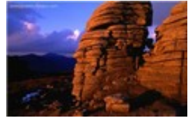
Summit Tor on Slieve Binnian, Mourne...