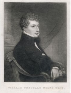
Theobald Wolfe Tone