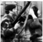
1972: 13 civilians are

Lord Saville, who is working on the mammoth report from his home in Surrey, said: “I am extremely sorry that we got the estimate wrong. The reason is that it is so huge. But we will finish it.”