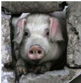
A selection of the best images from around the world

It is impossible to know how many men and women today find themselves in the same position as McCormick, struggling with their consciences over deeds committed during a long outbreak of inter-