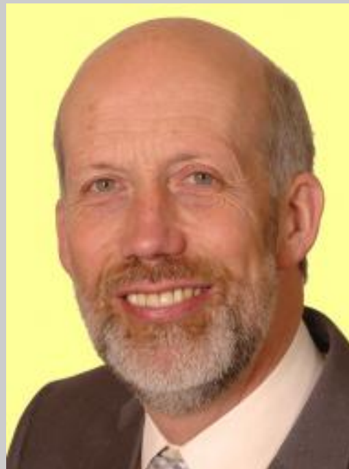
Alliance Leader, David Ford

11.22.30am UTC (GMT +0000) Tue 7th Nov 2006