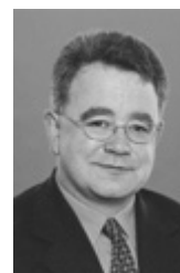
Seán O Fearghaíl (FF)