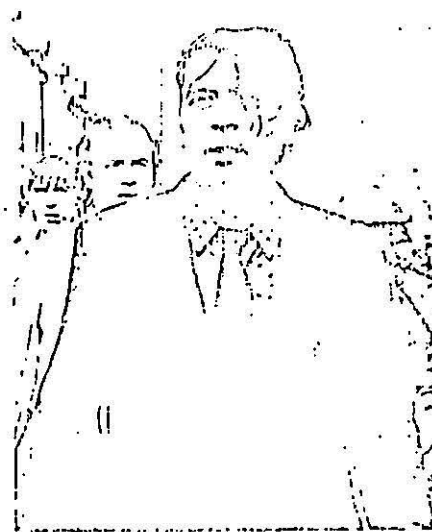
John Hume in the Bogside after British water cannon dispersed a peaceful demonstration of civil-rights marchers.

This is a spontaneous movement of women, which started following the deaths of three children who were killed when the army was chasing I.R.A. members in a car chase across Belfast. The army shot the I.R.A. car driver, the car went out of control and killed the three children walking along the street with their mother, who was very seriously injured. There was a spontaneous outburst of feeling by mothers in Belfast, which led to the peace campaign, which has brought thousands of people onto the