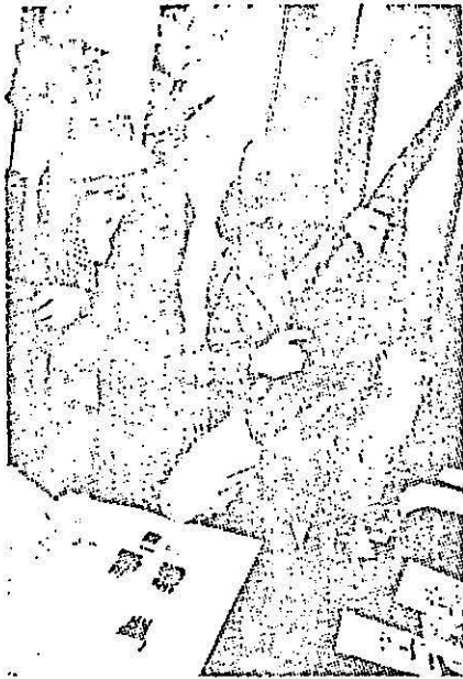
Masked to avoid identification, a combat unit of the Provisional Irish Republican Army prepares for a raid.

They are all members of the Unionist Coalition, which includes the Unionist Party, the Democratic Unionist Party, which is Paisley's party, and the United Ulster Unionist Movement, which is another extreme party that wants to