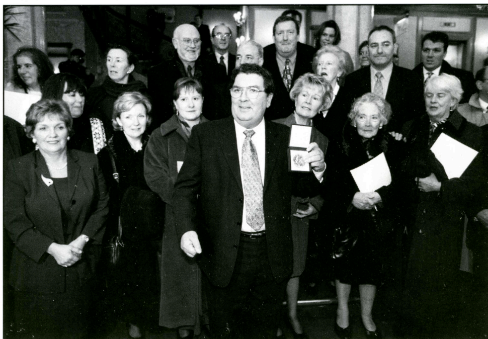
John Hume MP MEP Nobel Laureate in Oslo with family and friends

Takkatale Ved JOHN HUME MP MEP Vinner Av Nobel Fredspris 1998 Oslo Radhus Torsdag 10. Desember